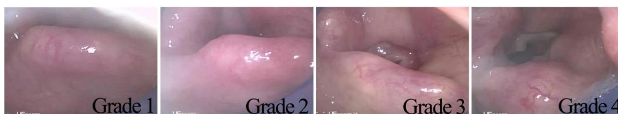
Fig. 2 SaCoVLM™ Glottic exposure grades. Grade 1: visualization of the lateral part of the right aryepiglottic fold and part of the laryngeal inlet, and the ventilation was good; Grade 2: visualization of the bilateral aryepiglottic fold and part of laryngeal inlet, and the ventilation was good; Grade 3: visualization of all laryngeal inlet and posterior glottis; Grade 4: visualization of the whole glottis

We divided the glottic exposure into four grades under SaCoVLM™ (Fig. 2). Grade 1: visualization of the lateral part of the right aryepiglottic fold and part of the laryngeal inlet, and the ventilation was good; Grade 2: visualization of the bilateral aryepiglottic fold and part of laryngeal inlet, and the ventilation was good; Grade 3: visualization of all laryngeal inlet and posterior glottis; Grade 4: visualization of the whole glottis