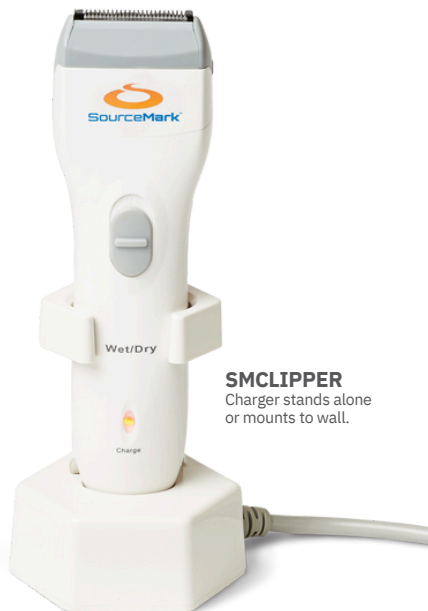
SMCLIPPER Charger stands alone or mounts to wall.